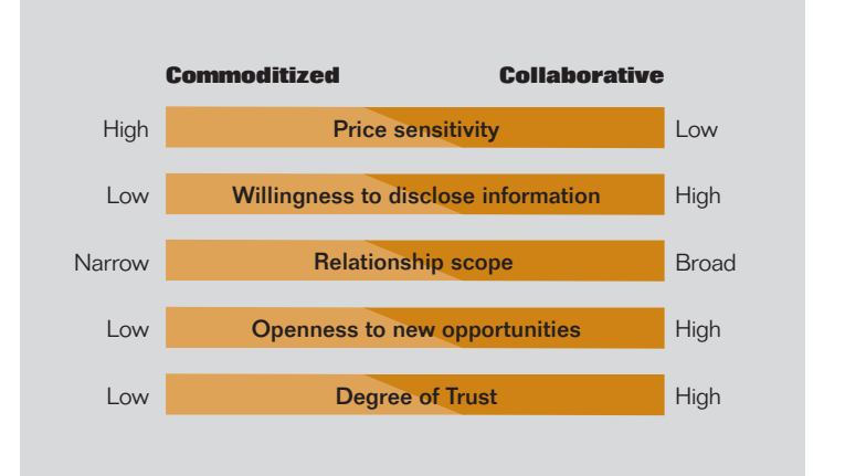
Figure 2: Client Relationship Characteristics

A deep, knowledge-based relationship is impossible to replicate by competitors because the unique collaboration and mutual understanding is developed over time.