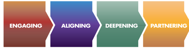
Figure 3: Stages of relationship development

The key issue is for relationship leaders to understand and live the principle of always moving the relationship forward. Figure 3 shows the four stages in relationship development. The first step is engaging with the client, mutually exploring compatibility and opportunities. The next step is aligning objectives, relationship styles, processes, culture, and technology so you can work together effectively. Having established the relationship, there is a phase of deepening and broadening the relationship, bringing in new contacts on both sides and building a true organization-wide relationship. This provides the foundation for partnering , which moves beyond the buy-sell relationship to creating value jointly with the client.